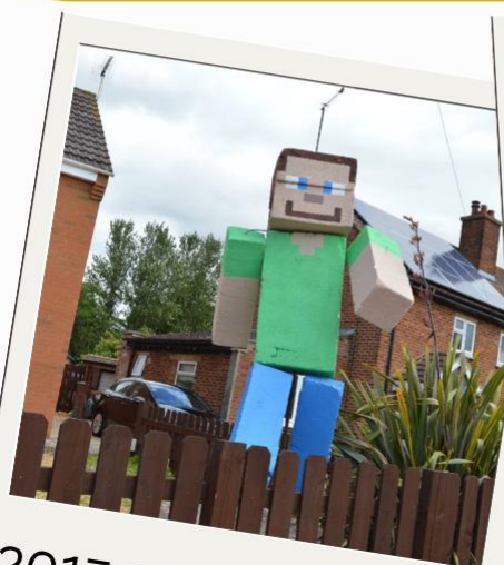
2017: Video Games

Go grab your straw, raid the wardrobe and let your creativity go wild for this years theme CELEBRATIONS!!