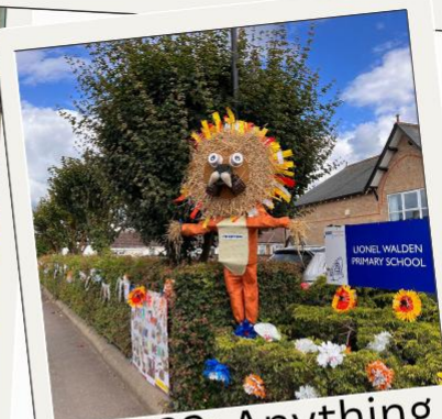
2022: Anything Goes

These are just a handful of our previous favourites!